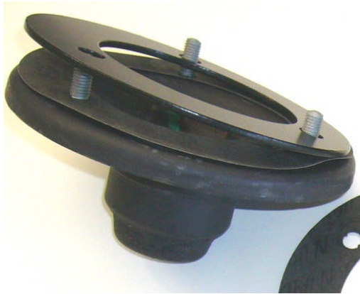
Illustration strut support